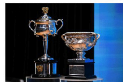
Daphne Akhurst (womens) and Norman Brookes (mens)